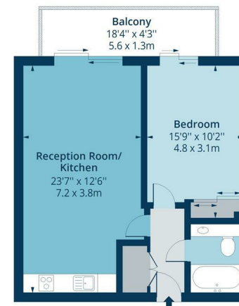
Third Floor Floor Area 565 Sq Ft - 52.50 Sq M